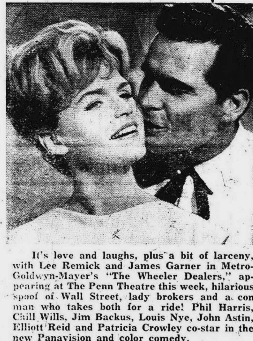
It's love and laughs, plus a bit of larceny, with Lee Remick and James Garner in Metro-Goldwyn-Mayer's "The Wheeler Dealers," appearing at The Penn Theatre this week, hilarious spoof of Wall Street, lady brokers and a con man who takes both for a ride! Phil Harris, Chill Wills, Jim Backus, Louis Nye, John Astin, Elliott Reid and Patricia Crowley co-star in the new Panavision and color comedy.