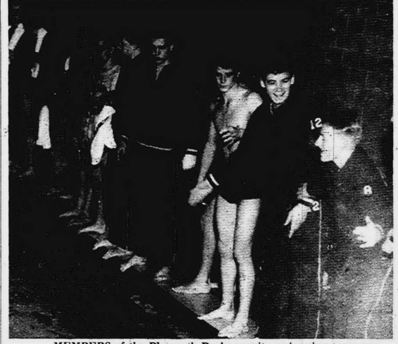
MEMBERS of the Plymouth Rocks varsity swimming team are shown cheering their fellow team-mates on to victory in Plymouth's lopsided win over a determined but short-handed Dearborn squad. The Rocks won 76-29.