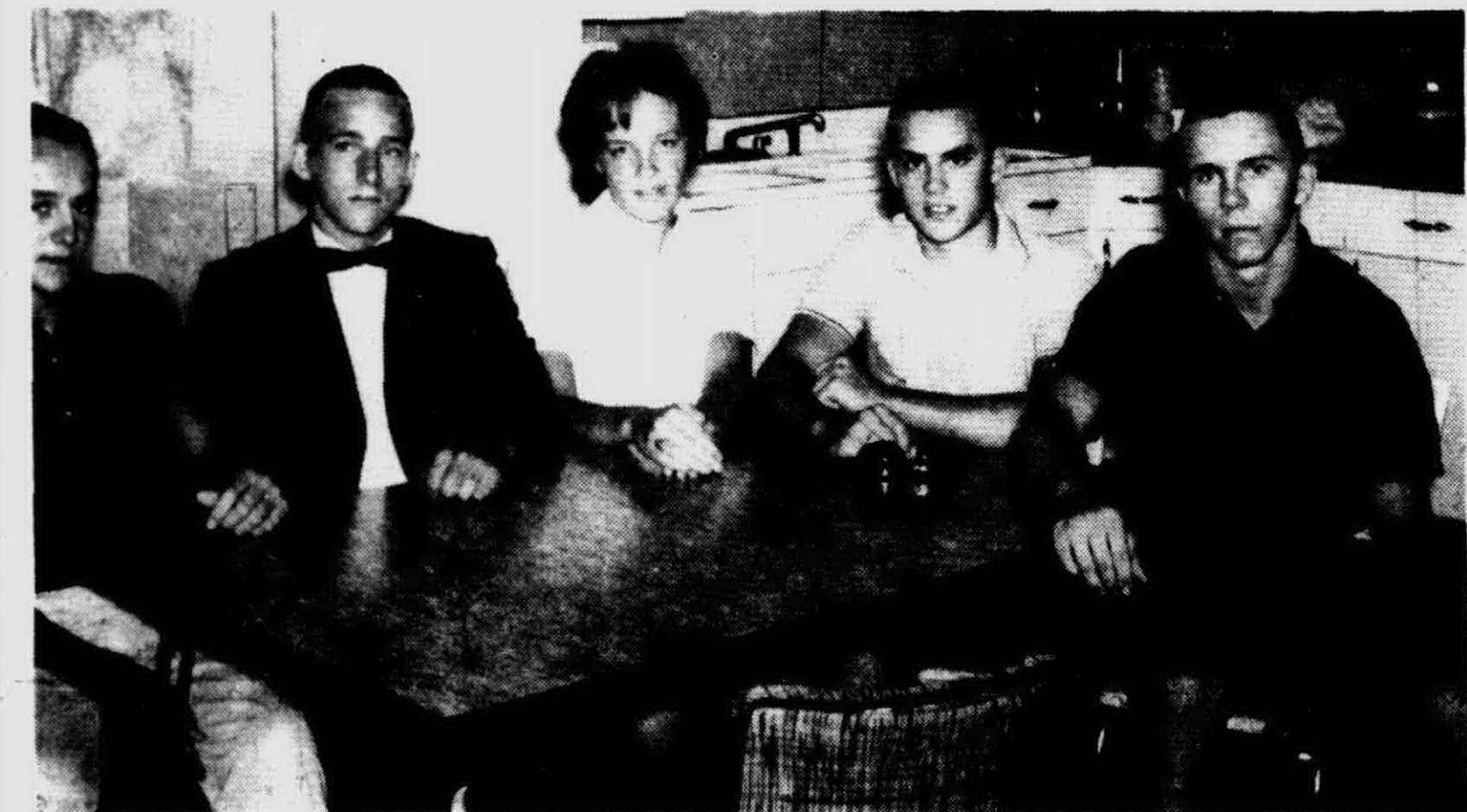
STUDENT LEADERS at Plymouth High School get together to discuss strategy for a campaign to get the importance of the school millage proposal home to all voters in the community.