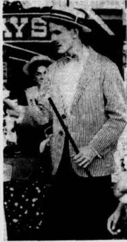
"OLD FASHIONED" ALSO describes the attire of this "barker" who used the "hardsell" technique of disposing of his wares in the Wonderland mall.

Hundreds from the three communities have made reservations but there is still ample room for all. If you're interested, contact one of the ticket agencies and make your reservations now.