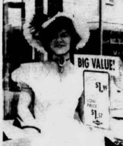
MOST OF THE SALES PEOPLE were in costume, many of them in old-fashioned gowns from the '90s, as with this winsome miss, ready to sell bargains from her table at Wonderland.