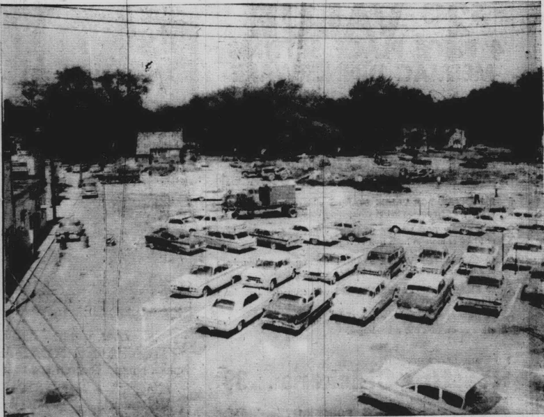
WIDE-ANGLE VIEW OF PLYMOUTH'S CENTRAL DOWNTOWN PARKING LOT WITH WORK IN PROGRESS