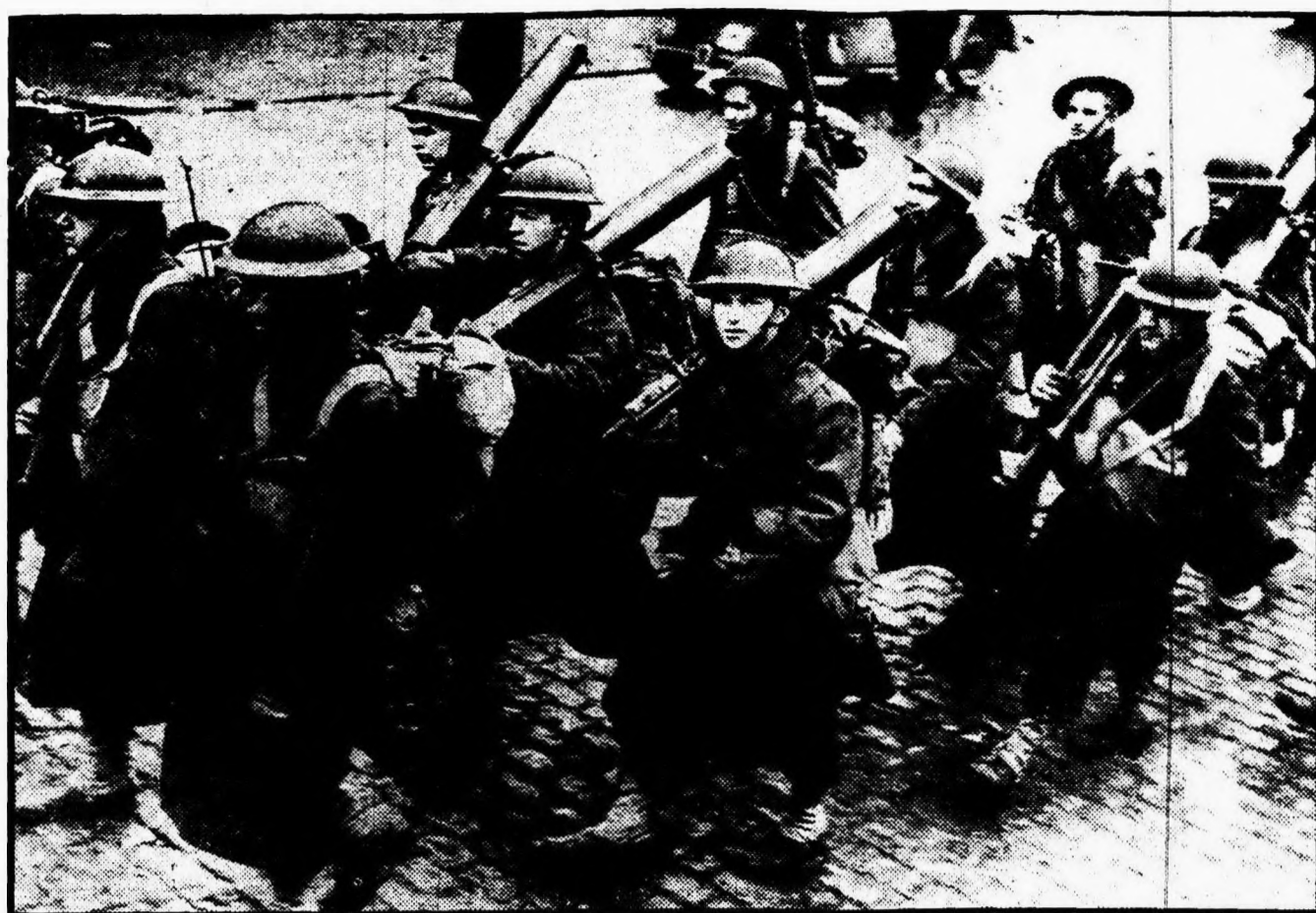
First contingent of the American Expeditionary Force to land on British soil since the last war is now encamped in Ulster. American troops pass through a town in Northern Ireland en route to camp.