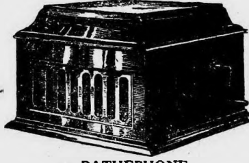
PATHEPHONE NO. 50

Mahogany, Golden or Fumed Oak. Perfect tone control device. Equipped to play all makes of disc records.