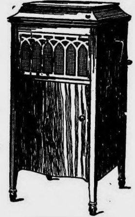
PATHEPHONE NO. 75

Mahogany, Golden, or Fumed Oak. Perfect tone control device. Equipped to play all makes of disc records.