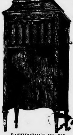
PATHEPHONE NO. 100 Mahogany, Golden, or Fumed Oak. Perfect tone control device. Equipped to play all makes of disc records.

Come in and let us play your favorite music on the Pathephone. You will be surprised how much purer, truer and more life-like the Sapphire Ball reproduces it. Then you will realize the advantages of the Pathe construction. Why not come in today?